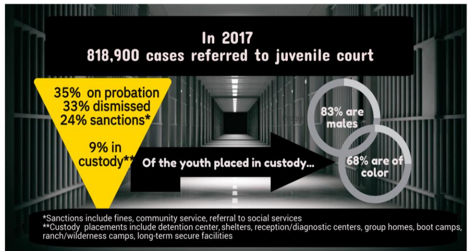
Figure 2. National estimates of juvenile case processing (based on data from Sickmund, Sladky, & Kang, 2019).

white youth (Hockenberry & Puzzanchera, 2019; OJJDP, 2018b). Despite efforts to reform policies and practices to increase racial and ethnic fairness among school resource officers, police officers, judges, prosecutors, defenders, and probation staff, youth of color are disproportionately represented in the justice system and often face more punitive treatment compared with their white counterparts (National Juvenile Justice Network, 2014).