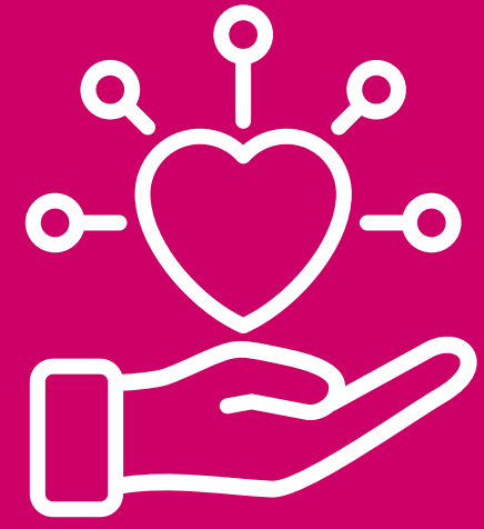
SMALL SCALE CAN STILL HAVE BIG IMPACTS