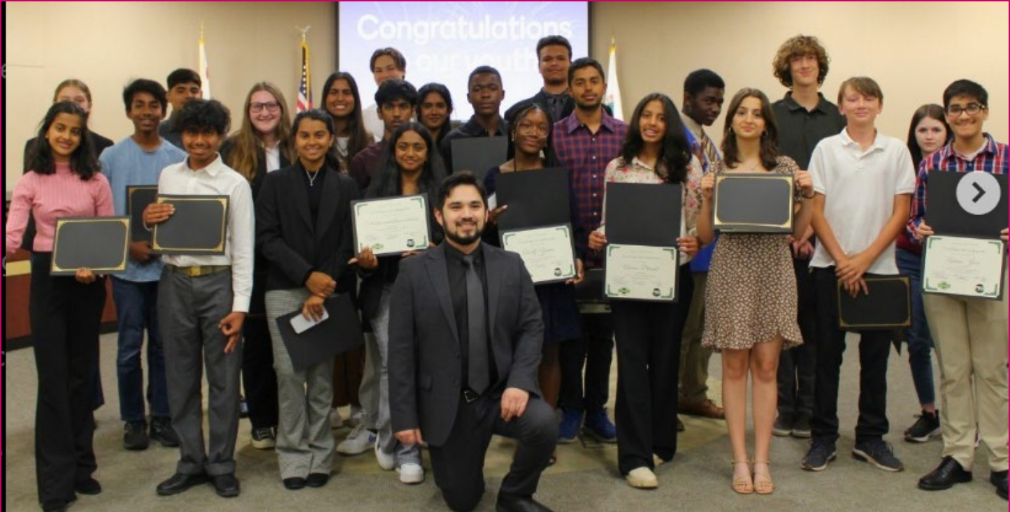
Youth at City Council May 2024