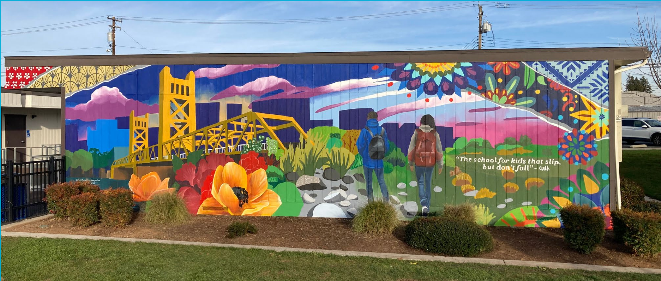
Prospect Community Day School December 2023