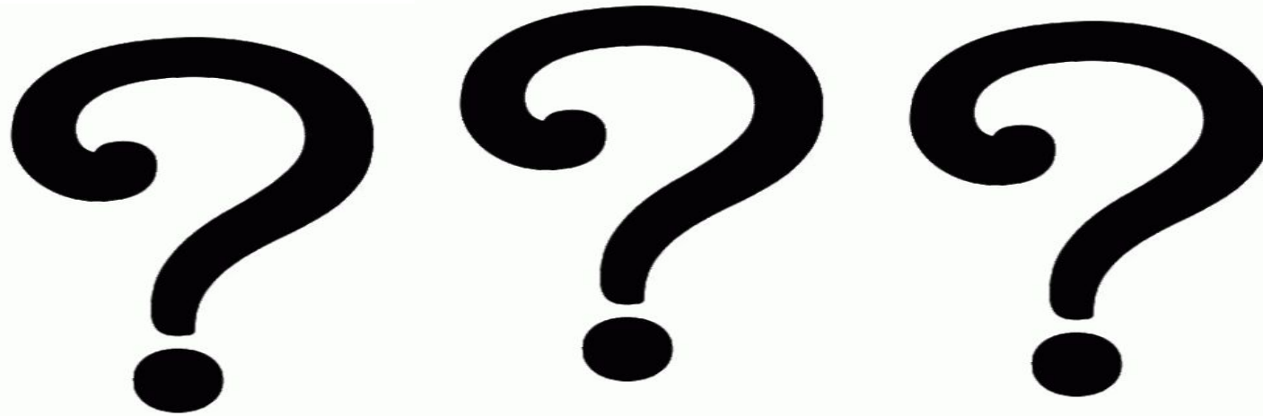
Three graphics of question marks.